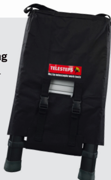
Carry Bag 9193-101