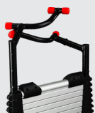
Top Support 9160-301